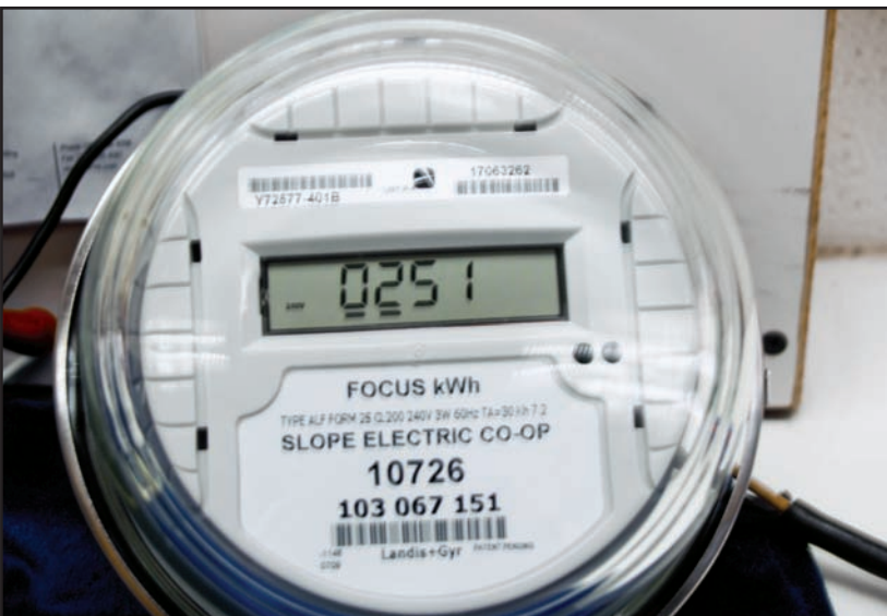
Digital voltage output