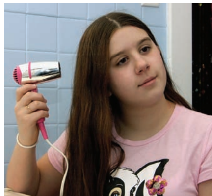
A ground-fault circuit interrupter should be installed anywhere an appliance might come into contact with water.

installed on all general purpose circuits throughout the home, particularly in older homes where arcing hazards could have developed over several years.