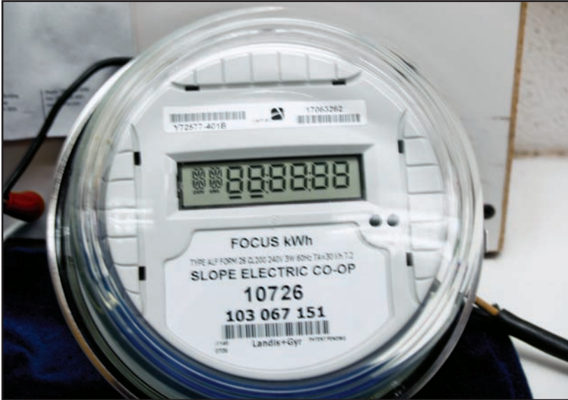
Meter in first sequence – 888888